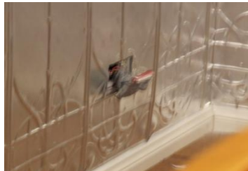
Installed panel with corner & cutouts