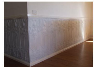
The wall complete after priming and painting.

All items are shown as a guide only. Pressed Tin Panels do not carry any responsibility for how individual panels are installed.