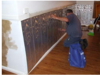
Showing marking out prior to installing