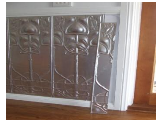
Shows panel with small infill section