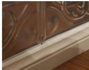
Show's nail holding in place temporarily prior to permanent fixing.