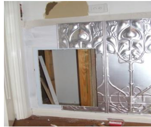
Marked out panel cut out for A/C vent