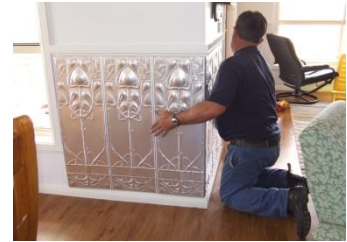
Panel folded returning around wall