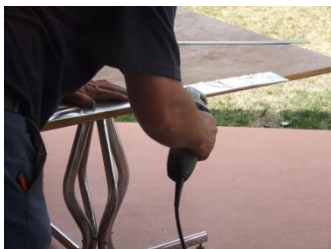
One way to cut infill sections out