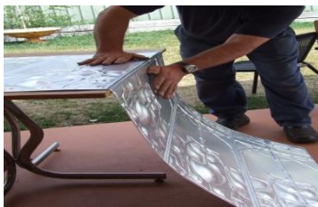
Showing how sheet can be folded simply Using a straight edge