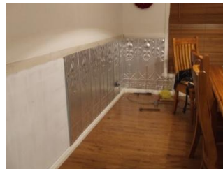
Panels being installed as shown