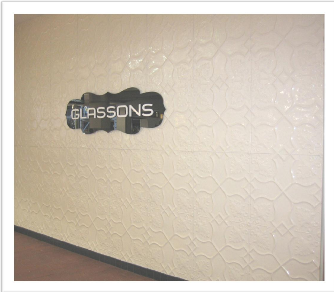
A High Gloss finish has been used on the Shield panel here with great effect.

Power points can be re connected and the covers popped back on.